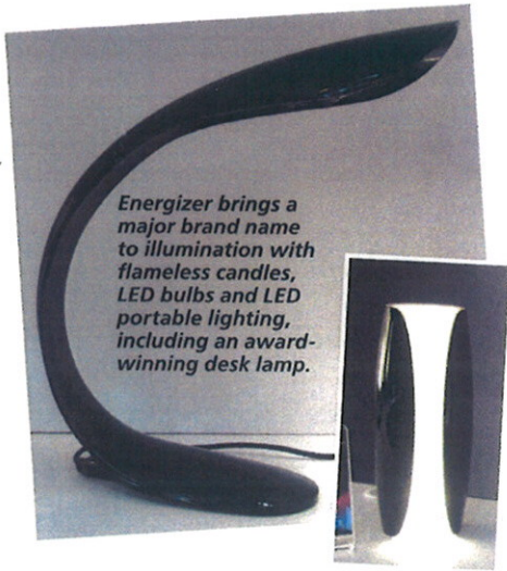
Energizer brings a major brand name to illumination with flameless candles, LED bulbs and LED portable lighting, including an award-winning desk lamp.