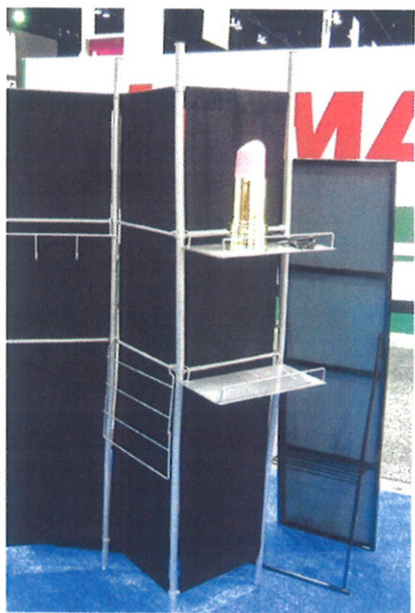
Above: Adesso offered products that turn what might be wasted space into storage including coat racks, portable lighting with shelves and the screens shown here.

Inevitably, though, the economy played a role in what launched. Yet that doesn't mean vendors weren't trying to provide consumers with a better standard of product, such as at Candle-Lite, where luxury came in under $10.