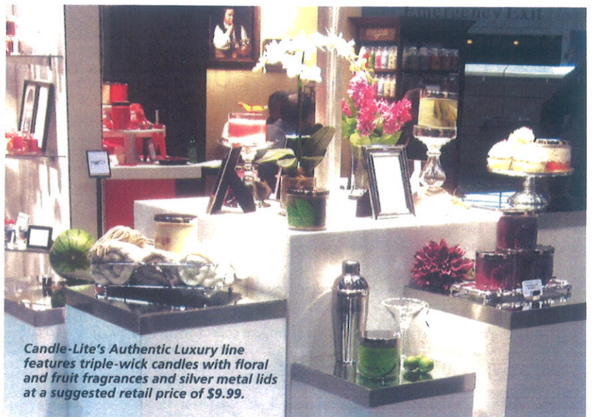
Candle-Lite's Authentic Luxury line features triple-wick candles with floral and fruit fragrances and silver metal lids at a suggested retail price of $9.99.