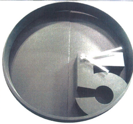
Above: Umbra approached wall art with a novel flair such as analog clocks, a decorative trend in an era of digital time.