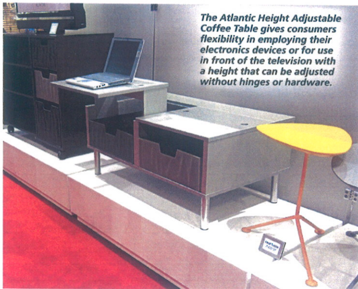
The Atlantic Height Adjustable Coffee Table gives consumers flexibility in employing their electronics devices or for use in front of the television with a height that can be adjusted without hinges or hardware.